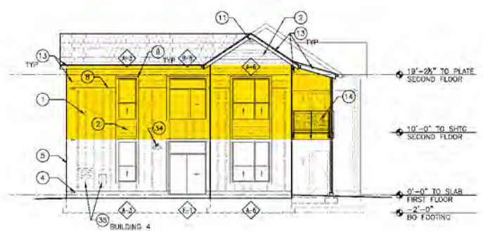
WEST ELEVATION (3) 1/8"=1'-0"