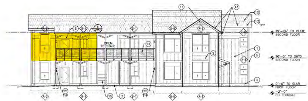
SOUTH ELEVATION (1) 1/8"=1'-0"