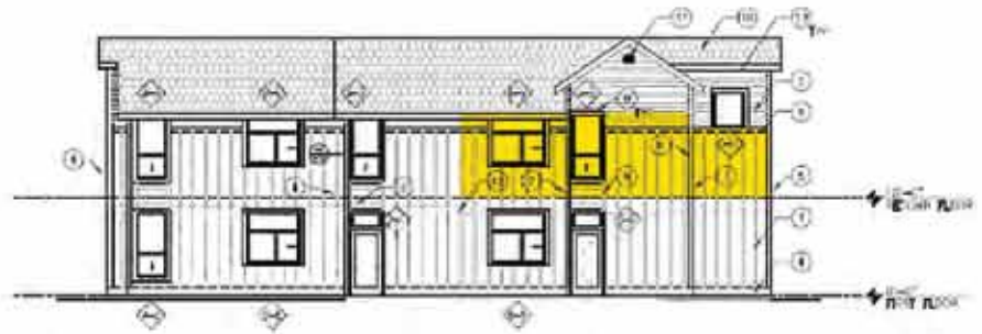
NORTH ELEVATION 10'-0" x 12'-0"