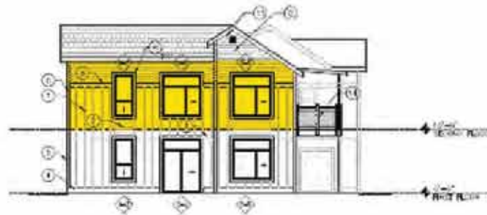
WEST ELEVATION 10'-0" x 12'-0"