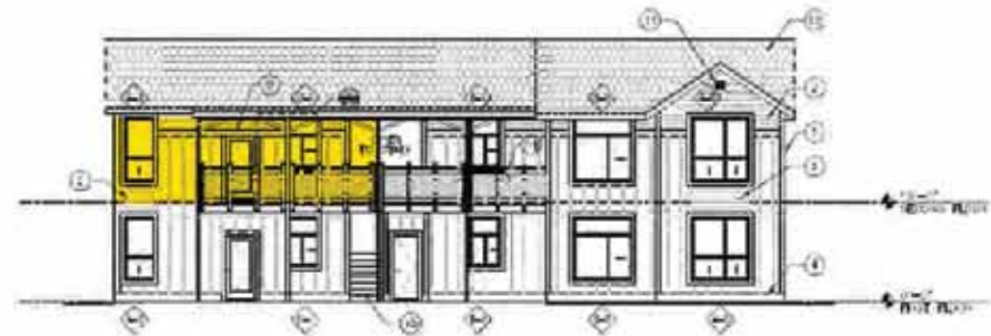
SOUTH ELEVATION 10'-0" x 12'-0"